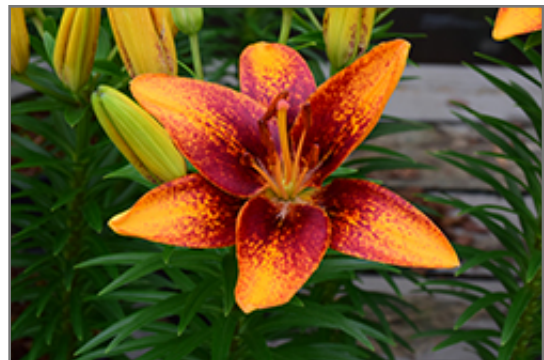
Lily Looks Tiny Orange Sensation Lily flowers