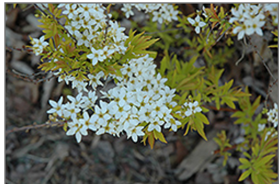
Mellow Yellow Spirea flowers