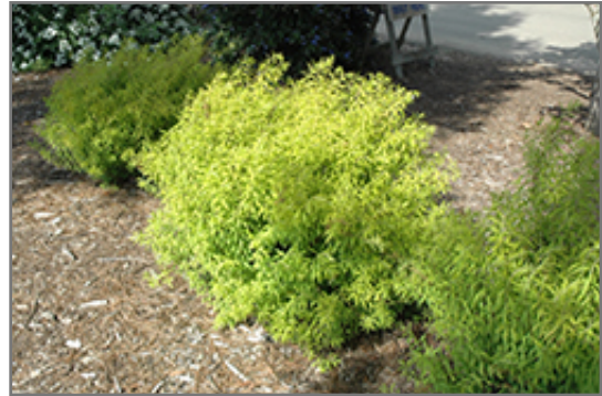
Mellow Yellow Spirea

This is a high maintenance shrub that will require regular care and upkeep, and should only be pruned after flowering to avoid removing any of the current season's flowers. It is a good choice for attracting butterflies to your yard, but is not particularly attractive to deer who tend to leave it alone in favor of tastier treats. It has no significant negative characteristics.