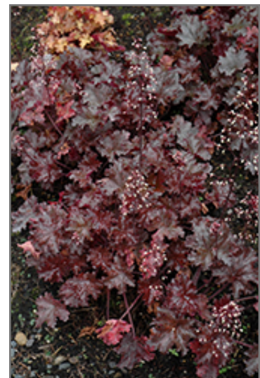
Black Taffeta Coral Bells