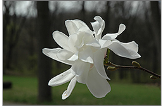
Spring Welcome Magnolia flowers