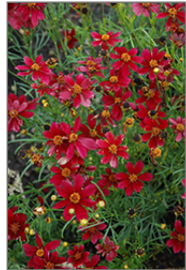
Red Satin Tickseed flowers