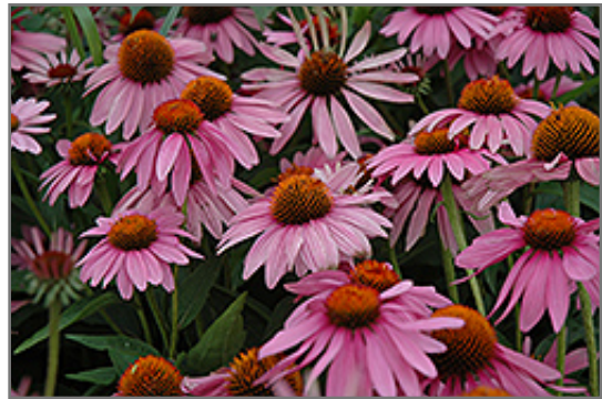
Magnus Coneflower flowers

Magnus Coneflower is an herbaceous perennial with an upright spreading habit of growth. Its medium texture blends into the garden, but can always be balanced by a couple of finer or coarser plants for an effective composition.