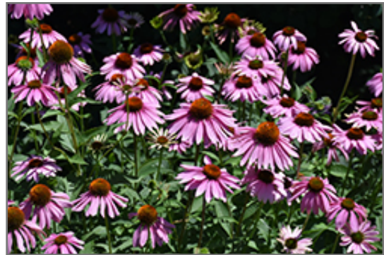
Magnus Coneflower flowers