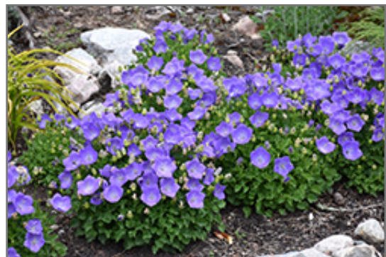
Rapido Blue Bellflower in bloom