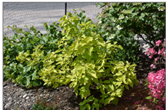
Neon Burst Dogwood