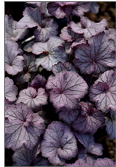
Northern Exposure Silver Coral Bells foliage

Northern Exposure Silver Coral Bells is recommended for the following landscape applications;