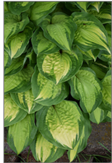
Island Breeze Hosta foliage