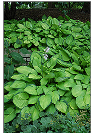
Gold Standard Hosta in bloom