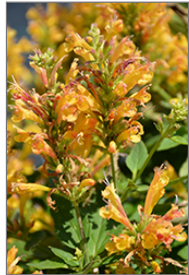
Poquito Butter Yellow Hyssop flowers

Poquito Butter Yellow Hyssop is recommended for the following landscape applications;