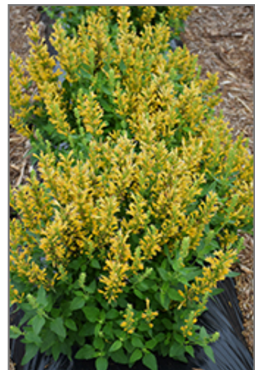
Poquito Butter Yellow Hyssop in bloom