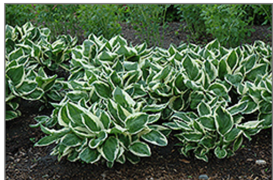
Minuteman Hosta