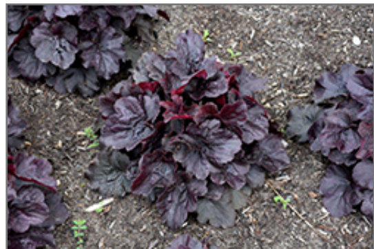
Northern Exposure Black Coral Bells