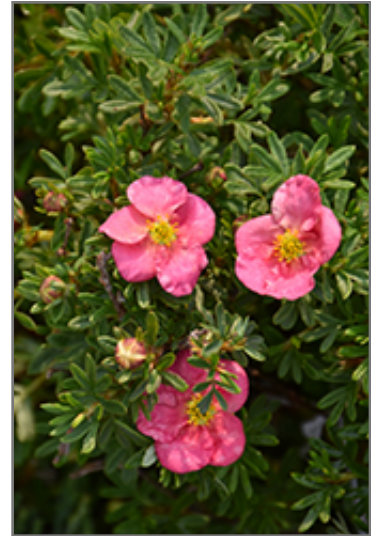
Bella Bellissima Potentilla flowers