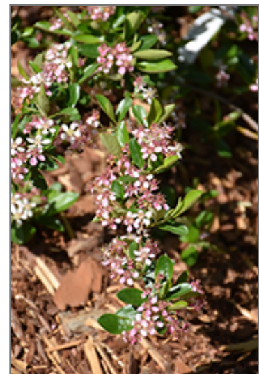
Ground Hug Aronia flowers