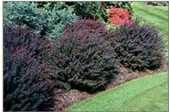
Sunjoy Mini Maroon Japanese Barberry

Sunjoy Mini Maroon Japanese Barberry is recommended for the following landscape applications;