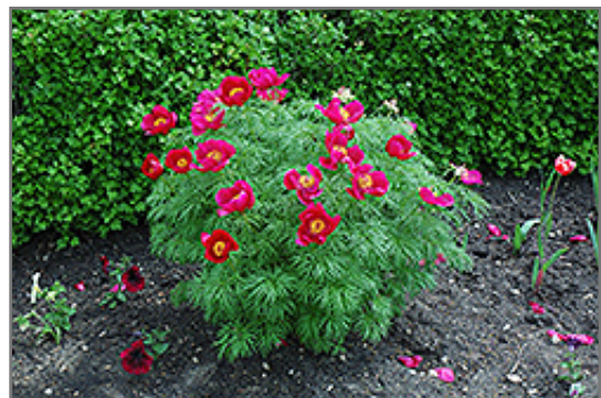
Fernleaf Peony in bloom