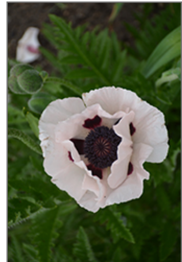
Royal Wedding Poppy flowers