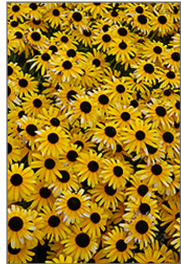
Viette's Little Suzy Coneflower flowers