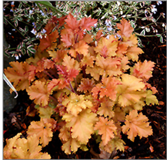
Marmalade Coral Bells foliage

Marmalade Coral Bells will grow to be about 8 inches tall at maturity extending to 18 inches tall with the flowers, with a spread of 16 inches. When grown in masses or used as a bedding plant, individual plants should be spaced approximately 14 inches apart. Its foliage tends to remain low and dense right to the ground. It grows at a medium rate, and under ideal conditions can be expected to live for approximately 10 years. As an evergreen perennial, this plant will typically keep its form and foliage year-round.