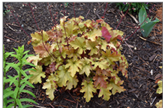
Marmalade Coral Bells