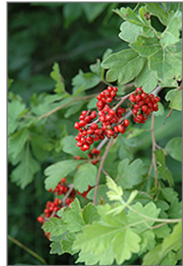
Fragrant Sumac fruit

Fragrant Sumac is recommended for the following landscape applications;