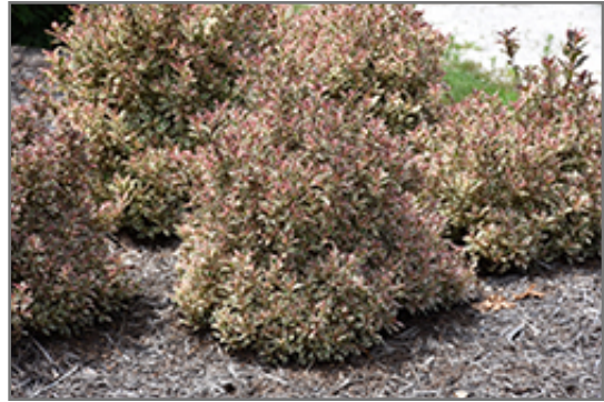
My Monet Weigela

My Monet Weigela makes a fine choice for the outdoor landscape, but it is also well-suited for use in outdoor pots and containers. It is often used as a 'filler' in the 'spiller-thriller-filler' container combination, providing a mass of flowers and foliage against which the thriller plants stand out. Note that when grown in a container, it may not perform exactly as indicated on the tag - this is to be expected. Also note that when growing plants in outdoor containers and baskets, they may require more frequent waterings than they would in the yard or garden. Be aware that in our climate, most plants cannot be expected to survive the winter if left in containers outdoors, and this plant is no exception. Contact our experts for more information on how to protect it over the winter months.