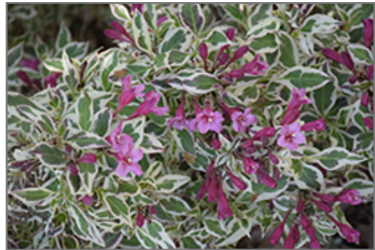
My Monet Weigela flowers

My Monet Weigela is recommended for the following landscape applications;