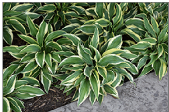
Wolverine Hosta