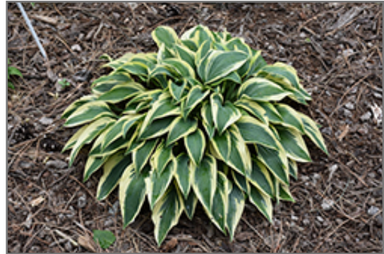
Wolverine Hosta

Wolverine Hosta will grow to be about 12 inches tall at maturity extending to 18 inches tall with the flowers, with a spread of 3 feet. When grown in masses or used as a bedding plant, individual plants should be spaced approximately 30 inches apart. Its foliage tends to remain dense right to the ground, not requiring facer plants in front. It grows at a medium rate, and under ideal conditions can be expected to live for approximately 10 years. As an herbaceous perennial, this plant will usually die back to the crown each winter, and will regrow from the base each spring. Be careful not to disturb the crown in late winter when it may not be readily seen!