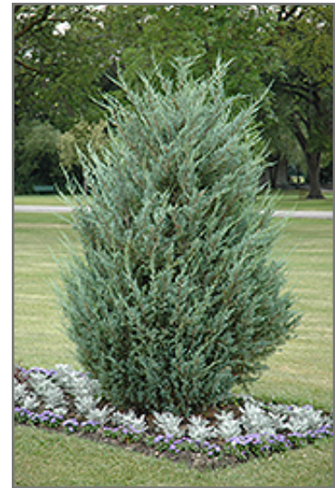
Moonglow Juniper