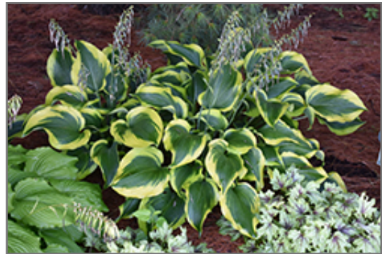
Atlantis Hosta

Atlantis Hosta is recommended for the following landscape applications;